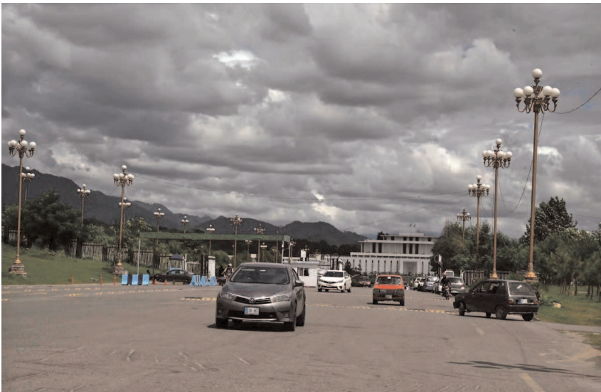
ISLAMABAD: An attractive view of thick clouds hovering over the sky of Federal Capital.