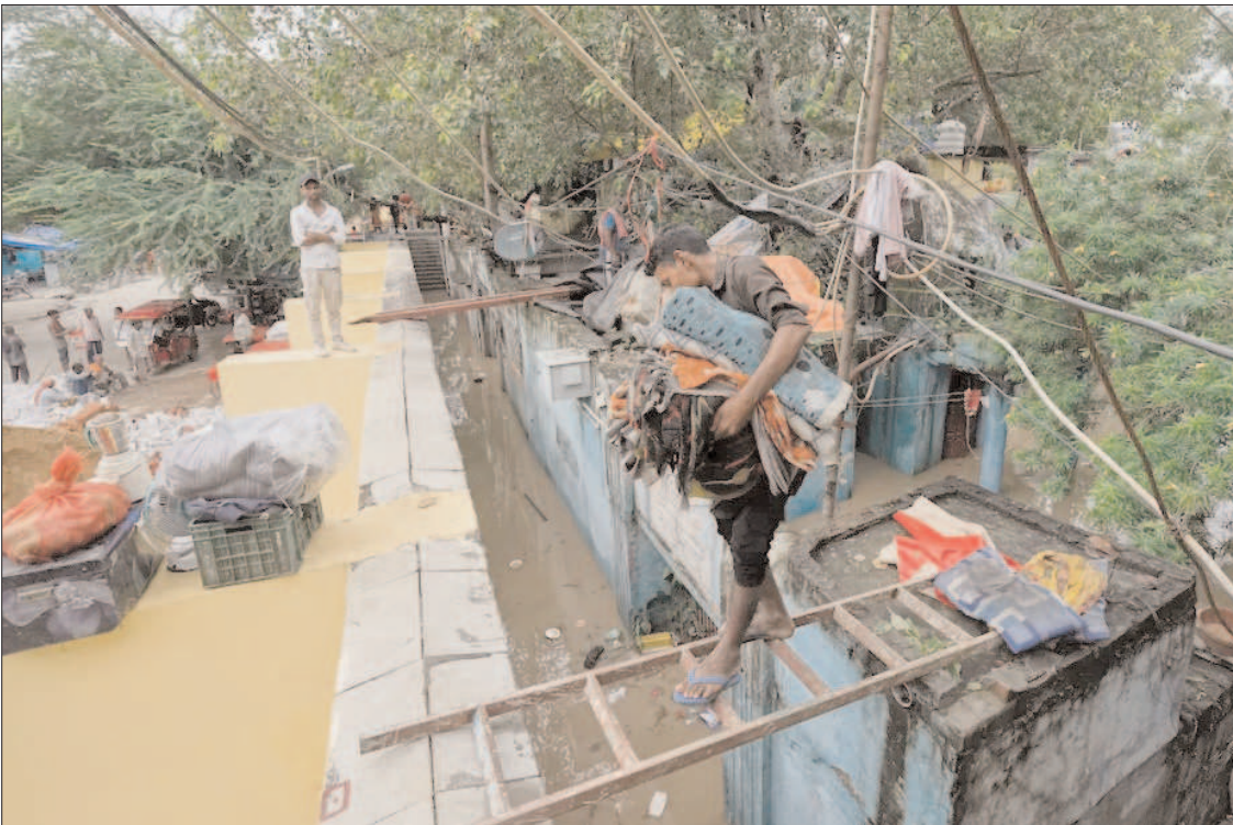
NEW DELHI: A resident moves his belongings to a safer place after the river Yamuna, swollen by incessant rain in the higher regions, overran its banks, in India.

She addressed the award ceremony with a pre-recorded video. "Poland and Cuba share a common thread in their history. Both people have suffered communist oppression," she said. "Poland freed itself from communism, with the unions leading the struggle," she said. "We Cubans continue to fight against communism. We have been fighting for 66 years against communist tyranny."