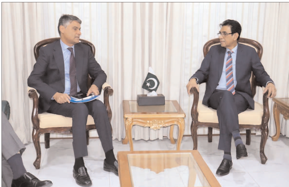
ISLAMABAD: UNESCO Chief to Pakistan called on Federal Minister for Education and Professional Training Dr. Khalid Maqbool Siddiqui.