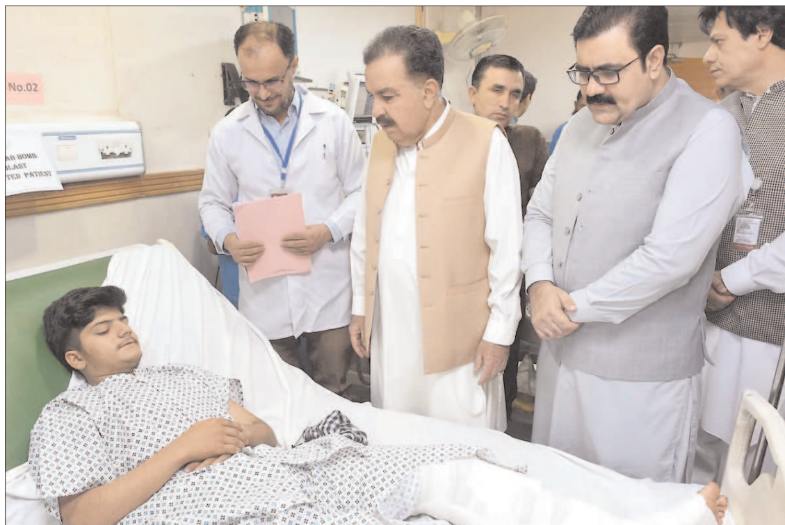
QUETTA: Governor of Balochistan, Sheikh Jaffar Khan Mandokhail inquiring about health of blast injured person at Trauma Centre.