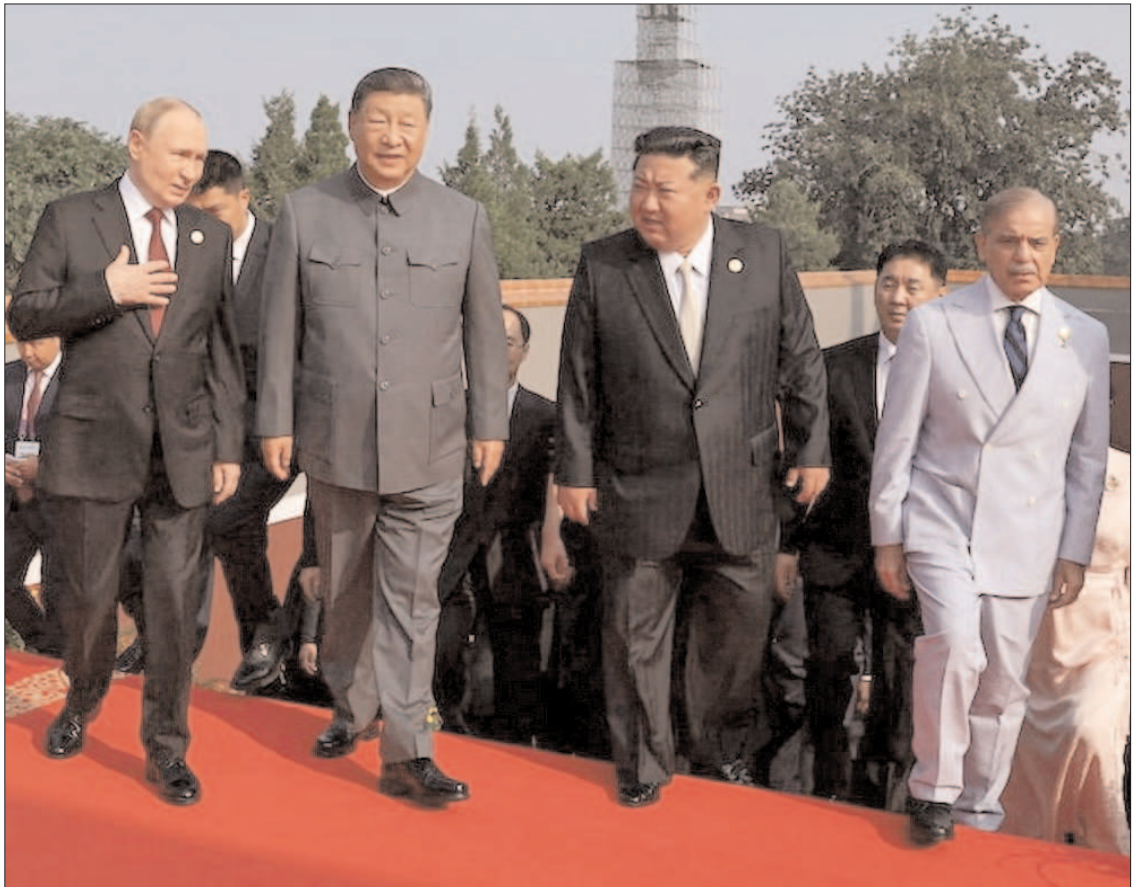
BEIJING: Prime Minister Shehbaz Sharif along with Russia's President Vladimir Putin and North Korea's Kim Jong Un walking with China's President Xi Jinping, during military parade in Tiananmen Square, China.