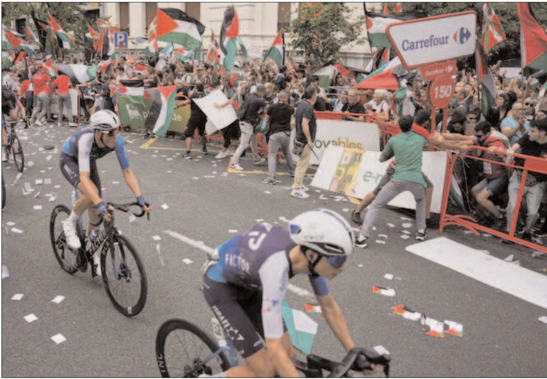
BILBAO: Riders of the Israel Premier Tech team compete as people holding Palestinian flags try to disrupt the eleventh stage of the Vuelta a Espana cycling race.

BERLIN (AFP): Germany coach Julian Nagelsmann on Monday backed new Liverpool recruit Florian Wirtz to return to his best form after a low-key start to his Premier League career. Wirtz joined Liverpool from Bayer Leverkusen in the summer for 125 million euros ($134 million) plus bonuses, but has not stood out despite the Reds winning their first three matches. Speaking to reporters in Bratislava before Germany's World Cup qualifier against Slovakia on Thursday, Nagelsmann called the 22-year-old midfielder "a key player for us". The coach said Wirtz had "not been incredibly dominant", and added he needed time to adjust at Liverpool. "You have to look at the whole gang playing around him. They've spent a few euros on the top squad they've got there and you don't always stand out as an individual. "Rather it's the overall construct which should work -- and it does work. "It's normal that you need a bit more time in a new culture, a new league, in a new stadium at a new club. "He'll play some great games there. He'll score, he'll assist. He can start that with us tomorrow," he added.