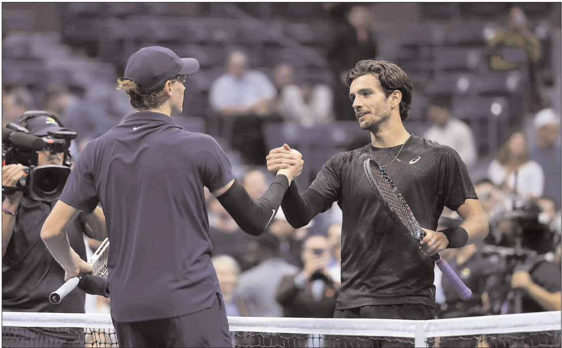
NEW YORK: Lorenzo Musetti (R) of Italy shakes hands with Jannik Sinner of Italy after his defeat in the Men's Quarterfinal match on Day Eleven of the 2025 US Open at USTA Billie Jean King National Tennis Center in the Flushing neighborhood of the Queens borough of New York City.