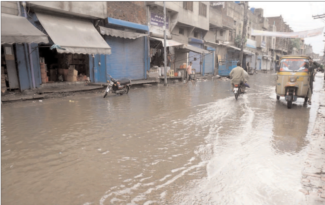
GUJRANWALA: Commuters facing difficulties in transportation due to stagnant rainwater caused by heavy downpour of monsoon season, at Eminabad Road.

SADIQABAD: At least three people were injured and two others kidnapped after armed katcha dacoits opened indiscriminate fire on vehicles traveling along the Sukkur-Multan M-5 Motorway. The incident took place late last night between Sadiqabad and Kashmore, when more than two dozen armed dacoits stormed the motorway, firing indiscriminately at passing vehicles. Multiple vehicles, including trucks, buses, and cars, were damaged in the attack, with burst tires and broken windows reported. According to police sources, at least three passengers sustained serious injuries and were immediately shifted to a hospital for treatment. Following the assault, the assailants fled into the katcha area. The dacoits also abducted two passengers—identified as Imran and Umar—both residents of Nawabshah. Motorway police and local law enforcement rushed to the scene upon receiving reports of the incident.