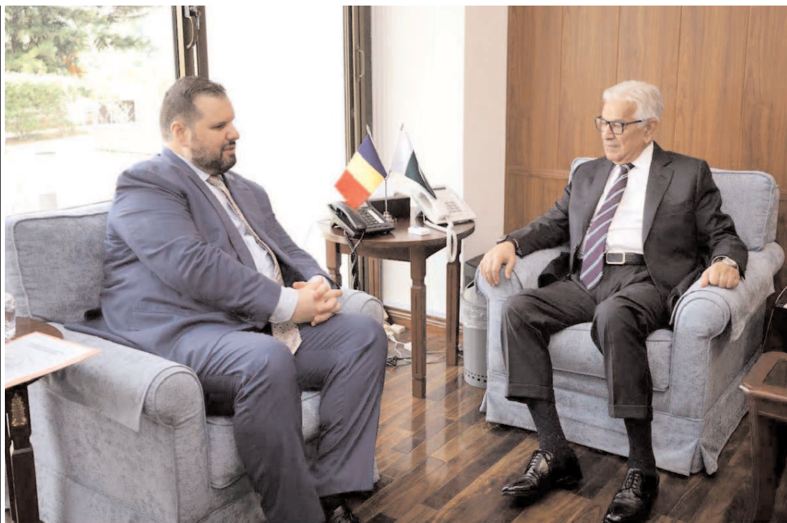
ISLAMABAD: Ambassador of Romania Dan Stoenescu meeting with Minister for Defence Khawaja Muhammad Asif.

He emphasized the arrest of suspects involved in illegal arms possession, arms display, and drug peddling, stressing that all available resources should be utilized to curb crimes. DIG directed that every possible step be taken to safeguard citizens' lives and property and to maintain public peace and order.