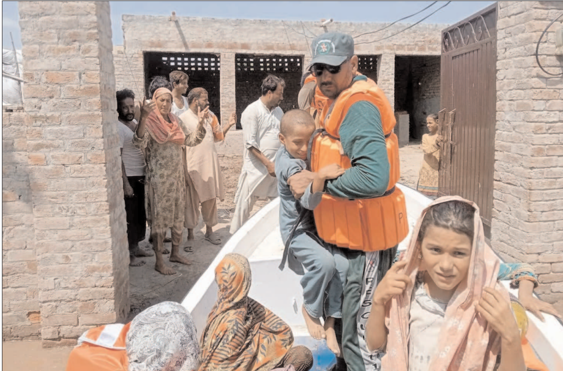
MULTAN: Rescue officials moving along with flood-affected people towards safer place after floodwater accumulated in their houses.