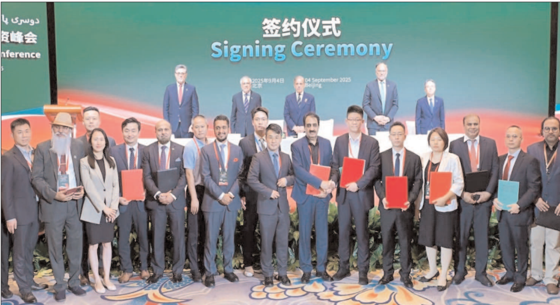
BEIJING: Prime Minister Shehbaz Sharif participating in MoU exchange ceremony of 2nd Pakistan-China B2B investment conference.